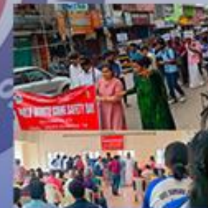
White Cane Day celebration & Blind Federation Annual meet on October 15, 2023