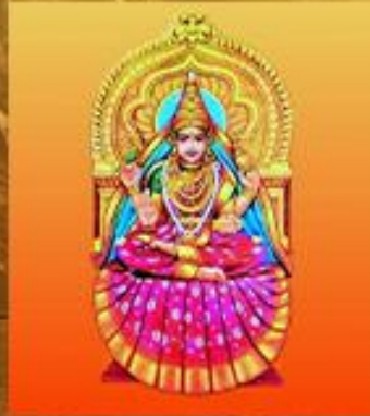
SREE SARADA PEETHAM, SRINGERI