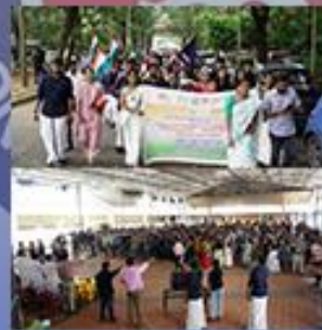
"Meri Matti Mera Desh" on October 15, 2023.