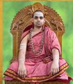
SRI SRI BHARATI THEERTHA MAHASANNIDHANAM OUR PATRON