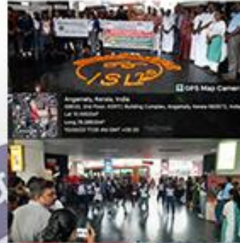
Flashmob conducted by NSS, Sree Sankara College, Kalady as part of ISL 2.0 at KSRTC Bus Stand, Angamaly on 15 September 2023