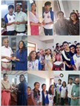
Teacher's Day gift for our Loving tutors on celebration of National Teachers Day