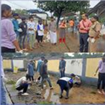
"Swachhata Hi Seva" cleaning at Angamaly Railway Station on October 1