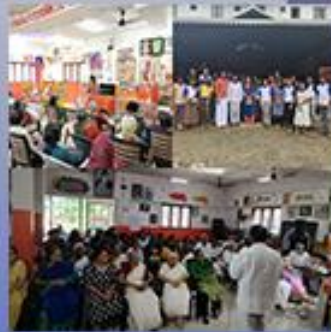
Visit to Sai Sadan Old Age home on October 2