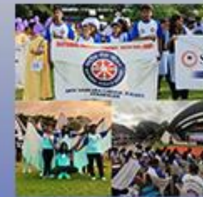
Bodhi Memory Walk, October 17, 2023