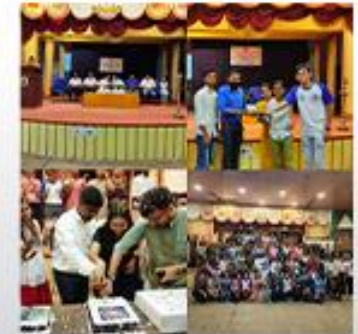
NSS week celebration September 18 - 22, NSS-048 Sree Sankara College, Kalady.